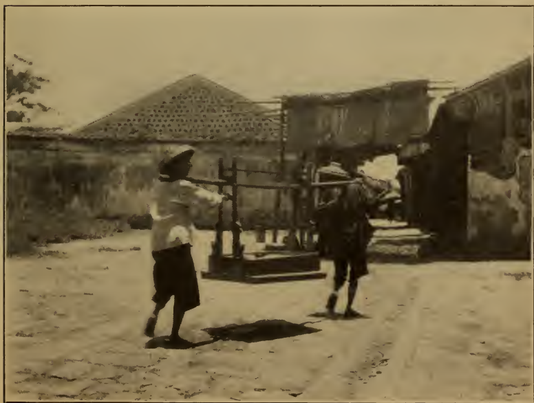
ON THE WAY TO THE FEAST.